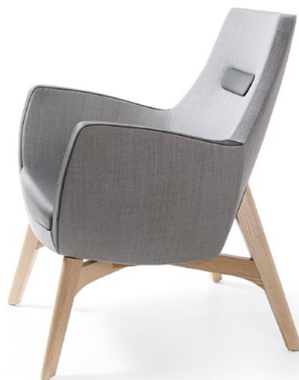
UM W 102