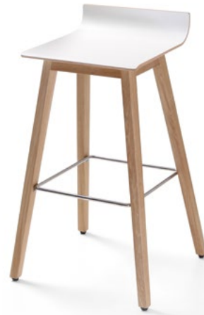
OTW HS 1N