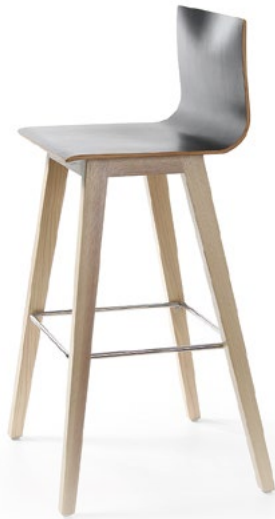
OTW H 1N