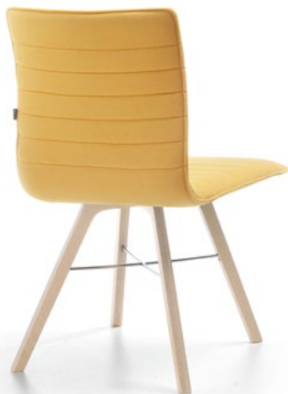
OTW 3DH 715