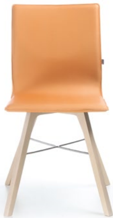
OTW 715 4N