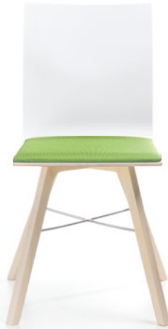
OTW 715 2N