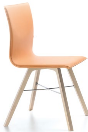
OTW 715 4N