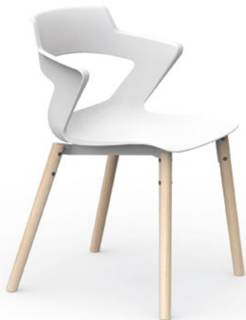
SKW 270 1N