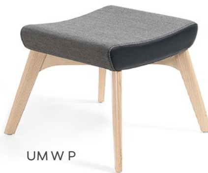
UM W P