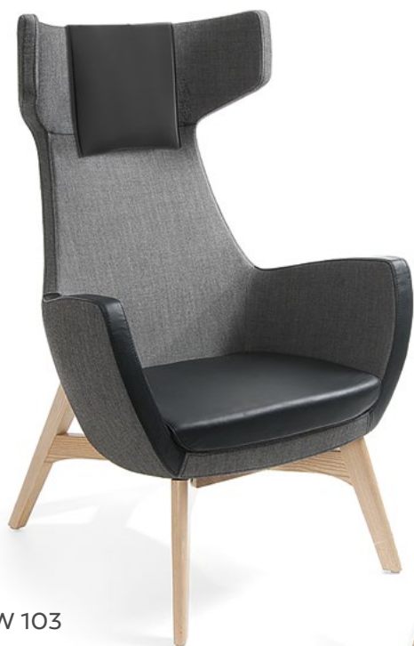
UM W 103