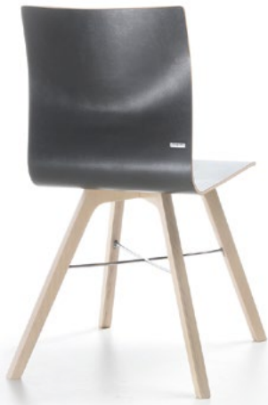
OTW 715 1N