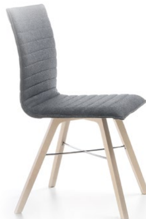
OTW 3DH 715