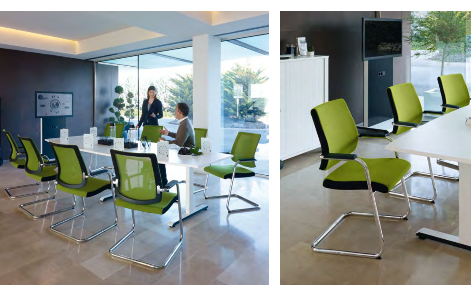
All aboard. The large boat shape provides space for up to ten people.

Intelligent functionality and efficiency are also key features of the conference tables in the temptation c product family. A range of desktop formats in several sizes, materials and colours are available to choose from. So you can create attractive configurations for team discussions to suit every requirement and room layout.