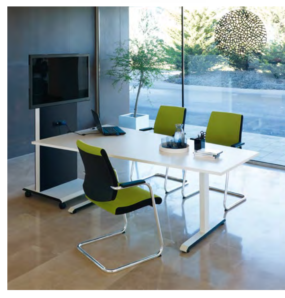
Communicative. The trapezium shape is ideal when using the monitor caddy , for training sessions and video conferences, for example.