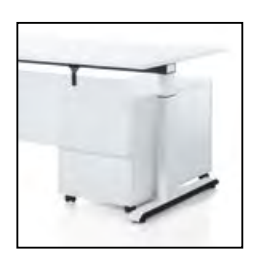
Modesty panel. The modesty panel (plexiglass, laminate or real wood veneer) ensures privacy from prying eyes.