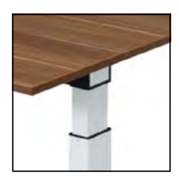
Native real wood veneers. A fascinatingly beautiful and environmentally friendly base material from sustainably managed forests.