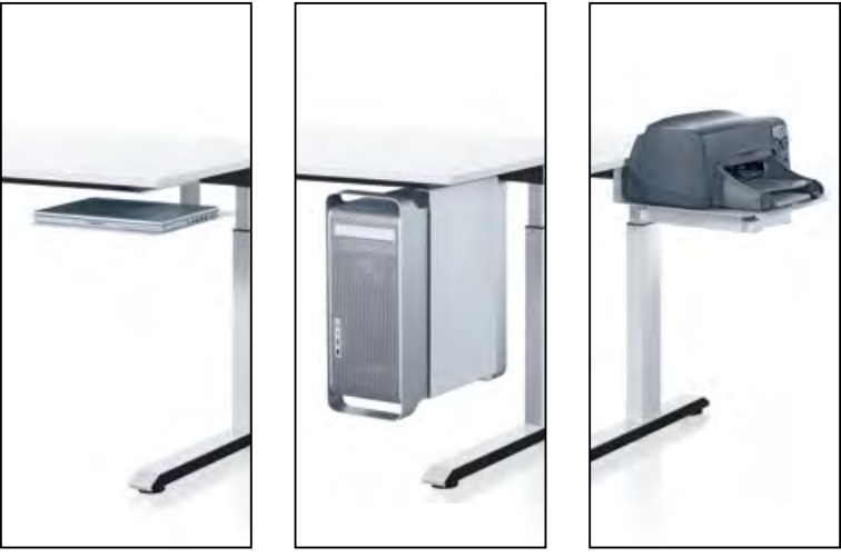
Practical. Sedus temptation c – the intelligent solution: individual workstations can be custom-equipped with the printer shelf, the laptop holder, the PC housing holder, etc. – all within arm's reach.