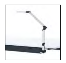
System adapter. For mounting lights, screens, function bridges, etc.

With the numerous extension and linking elements, temptation c can be configured to meet all business needs. One of the options is the classic consultation scenario. In order to switch from the computer to the person you wish to talk to, simply swivel round to face him or her. You no longer need an alternative desk for meetings and, in turn, an uncluttered and harmonious office environment is ensured. The curvature of the desk offers enough surface as well as a relaxed and pleasant atmosphere for meetings.