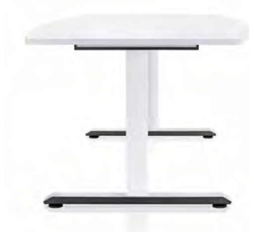
Harmonised design. Style and finishes match the desking.