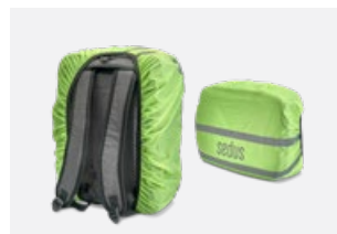
The rain cover with reflectors also ensures extra safety in bad weather

Using the practical cable grommets, it is possible to connect electronic devices to a powerbank for charging