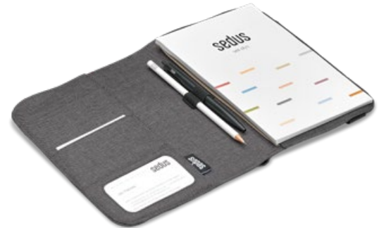
Conference folder – suitable for notepads in DIN A5 (dimensions when closed: 18 x 23 x 2 cm)