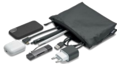
Hygiene bag (dimensions: 19.5 x 14.5 cm)