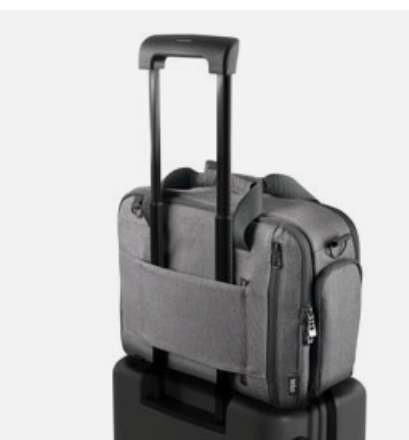
Can be securely attached to a trolley by means of an external trolley strap